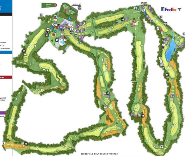
SEDFIELD GOLF COURSE YARDAGE